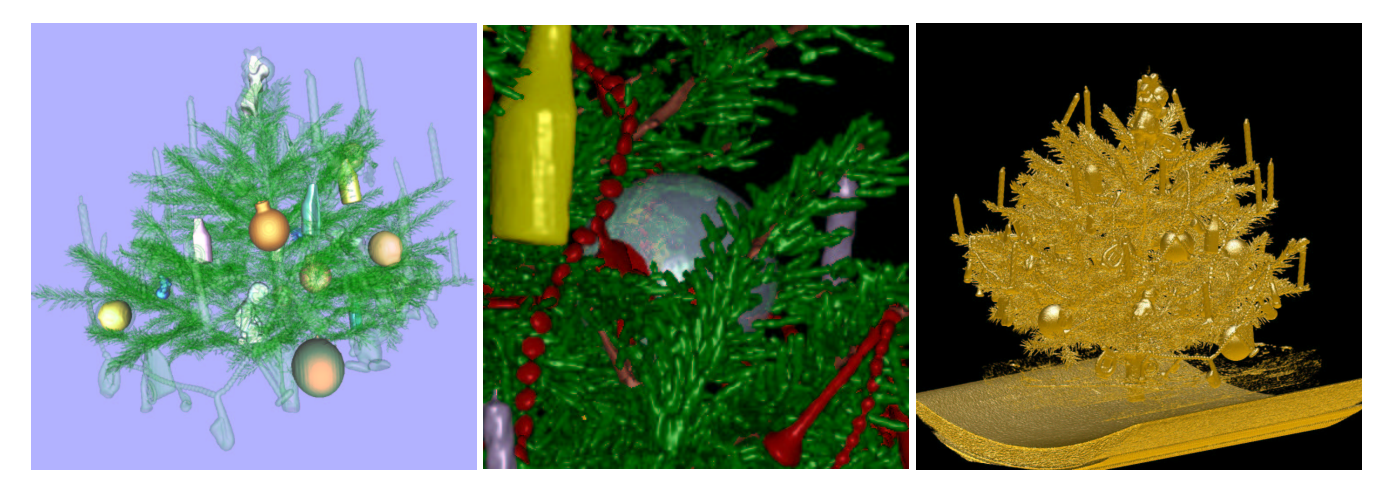
Figure 3: From left to right: OpenGL polygon rendering based on marching cubes surface extraction. Ray tracing of the segmented tree. Direct volume rendering: ray casting.