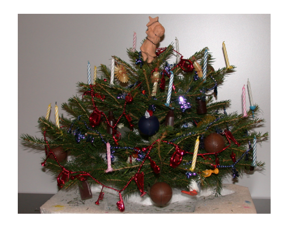
Figure 2: A picture of the Christmas tree.

Segmentation of tomographic data sets is traditionally depending on the goals, either very simple or very complicated. The simple task in our case was classification of the foreground voxels (the tree itself with decorations) with respect to the background. This task was accomplished easily by thresholding. The hard segmentation task was to separate various tissues of the tree (trunk and needles) and decorations. For this purpose we used two segmentation tools, ISEG [9] and the segmentation functionality of JVision (a medical 3D workstation from TIANI MedGraph [13]). ISEG is a general purpose interactive system for segmentation of 3D data sets based on the assumption of spatial object homogeneity. Such