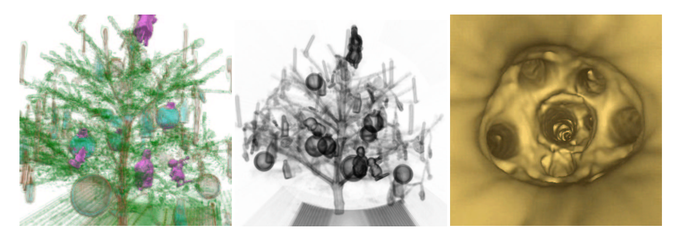
Figure 4: From left to right: Interactive wavelet encoded multiresolution volume rendering. Non-photorealistic rendering using the "Bubble Model". View of a seven-fold branch in a virtual arboroscopy.