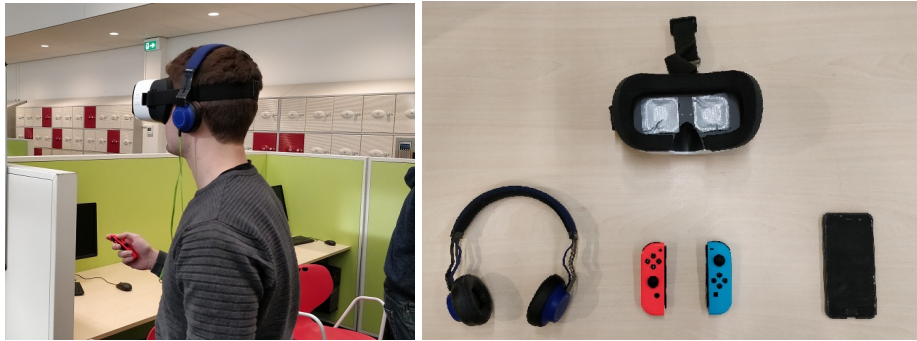
Fig. 1: The setup used to play Loud and Clear